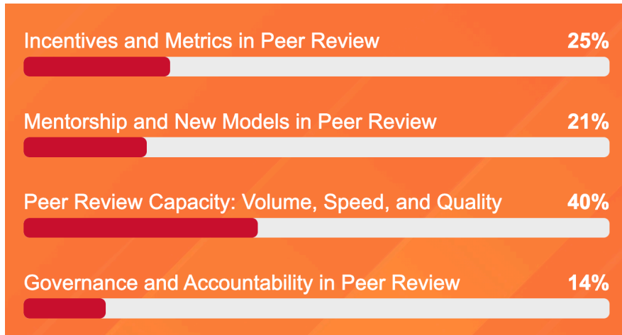
Figure 1: Results of global Peer Review Week 2026 theme poll

Building on this broad participation, the results of the poll offer a clear and compelling view of the community's current priorities. A total of 2,115 votes were recorded, marking this the year with the highest level of participation in PRW history. Peer Review Capacity: Volume, Speed, and Quality emerged as the leading theme, receiving 40% of the total votes , while the remaining themes followed at a noticeable distance (Figure 1).